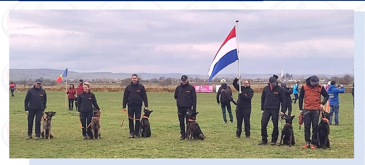
Team of the Netherlands 2023

The atmosphere between sporters was once again heartwarming and there was a sportive fight for the honourable titles in all areas. The CCBOR also organized various shows, so that the Dutch Shepherd could also be judged on exterior.